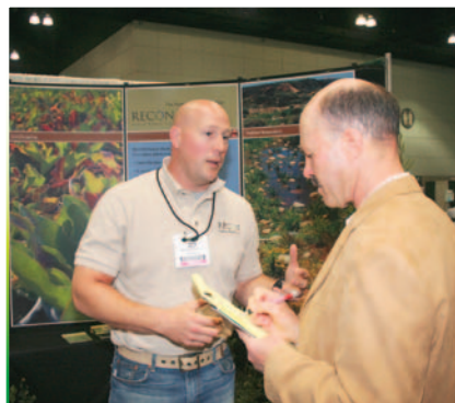
Expand your sales market.