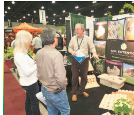
Network with key decision makers in the landscape industry.