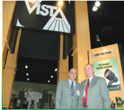
Put your product in front of business owners.