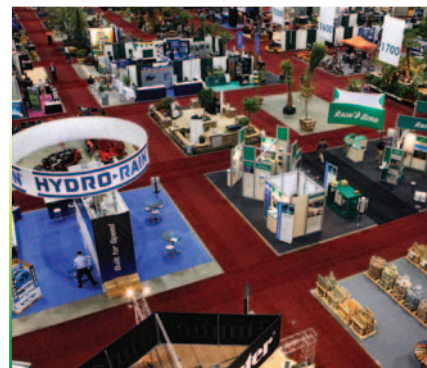
Increase your market visibility.