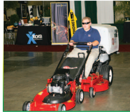
Give customers hands-on time with your product.