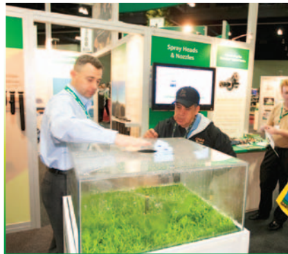
Launch a new product or service.